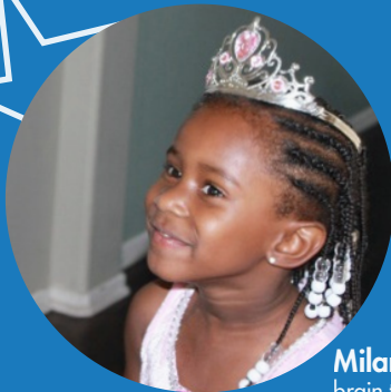
Milan, 3 brain tumor