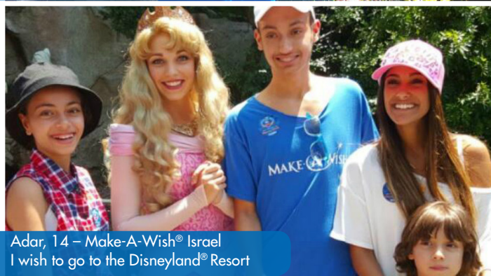
Adar, 14 – Make-A-Wish® Israel I wish to go to the Disneyland® Resort